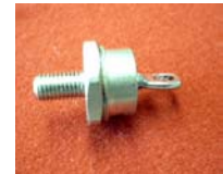
1N4510 Standard Rectifier (trr More Than 500ns)